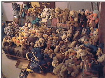
All of Bunny Island turned out for this recent photograph.

But, for those of you who don't know the tale of